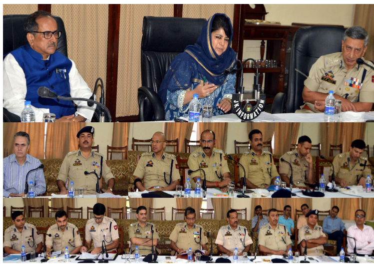
She asked them to take any genuine complaint of corruption against any

Chairing a meeting with all the District Superintendents of Police and range DIGs of Jammu province here, the Chief Minister asked the Police officers to adopt professional approaches of community and social policing to provide relief to the people from the situations of distress and difficulty. She asked the District SPs to ensure that the officers and constabulary in their jurisdictions perform their duty with utmost dedication.