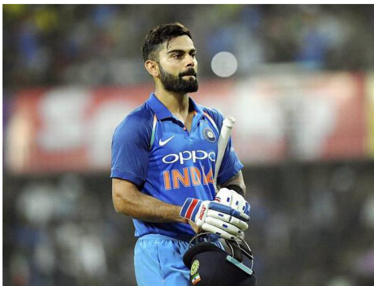
International Cricket Council (ICC) ratings.

"Credit to the whole squad for the series win, but the journey stops only after the final game," said Kohli, the top ODI and T20 batsman in the In-