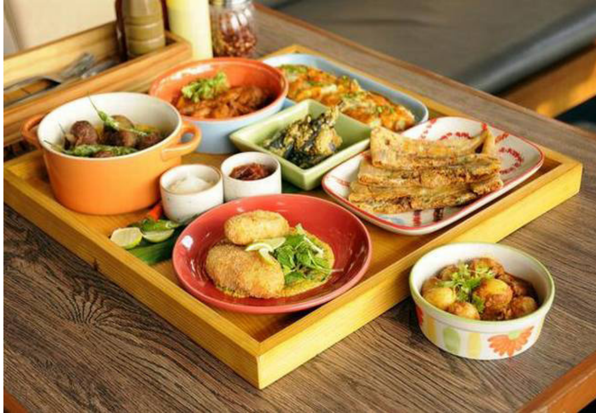
and fried – was just right.

The gravy in the kamala bhetki was lightly flavoured with oranges, so it was mildly sweet, as Bengali food can be. The prawns were sharp with mustard and the fish cutlet – with mashed boneless fish mixed with potato, crumbed