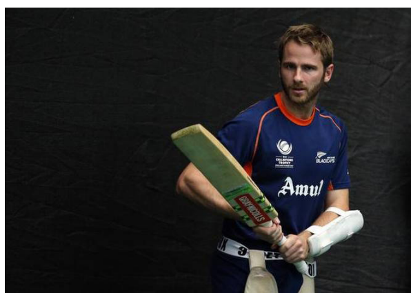
in New Zealand A to perform and put their best foot forward."

"With a number of our top guys already playing in India, it's helpful to be able to select the squad in two parts. With six spots left, there's an obvious incentive for the players