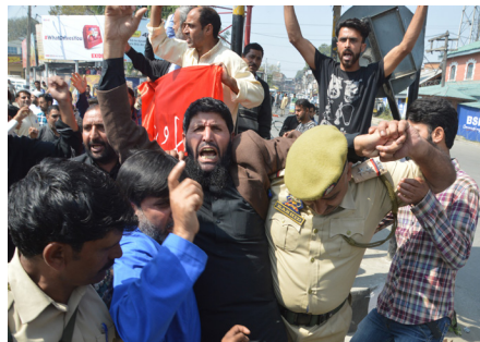
Maisuma, Kothibagh, Sherghari, Kralkhud, Batamalo and Ram Munishi Bagh police ▶ See Normal ...Pg 02

The restrictions had been placed mostly in some areas of Shaheed Gunj, Karan Nagar,