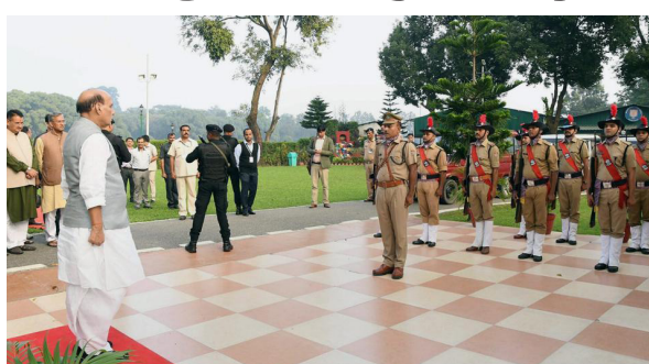
Sikkim sector, Singh said there has been a "perceptual difference" of the border between the two neighbours for long and that he was sure that this issue will be "resolved" with time. "The border issue will be ▶ See Rajnath ...Pg 02

Undertaking the first-ever visit by a senior minister to the China border after the recent resolution of the stand-off in the Doklam area of the