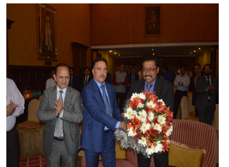
to us throughout our association." "While discharging his duties as the ▶ See Bank ...Pg 02