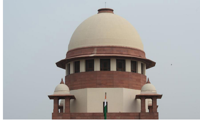
The counsel had told the court that Perarivalan was held guilty of supplying the batteries for the belt-bomb worn by Dhanu that had killed Rajiv Gandhi.