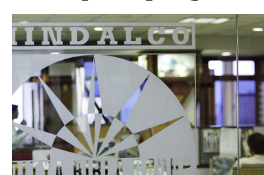
"Along with the treasury balance this amount was utilised to prepay the existing borrowings. Consequently, there is a substantial improvement in consolidated net debt to EBITDA," Birla said. The company's overseas subsidiary Novelis also refinanced USD 4.3 billion of its long term debt. The annual cash

MUMBAI: Hindalco Industries, an Aditya Birla Group company, plans to prepay another Rs 1,100-crore debt this month to further leverage its balance sheet. "We have already repaid Rs 7,815 crore and plan to repay another Rs 1,100 crore in the current month, which will save interest cost of Rs 800 crore in the current fiscal," Hindalco chairman Kumar Mangalam Birla told shareholders at the company's annual general meeting (AGM) here. "In line with our stated objective to deleverage the balance sheet, we have successfully raised USD 500 million through a qualified institutional placement (QIP).