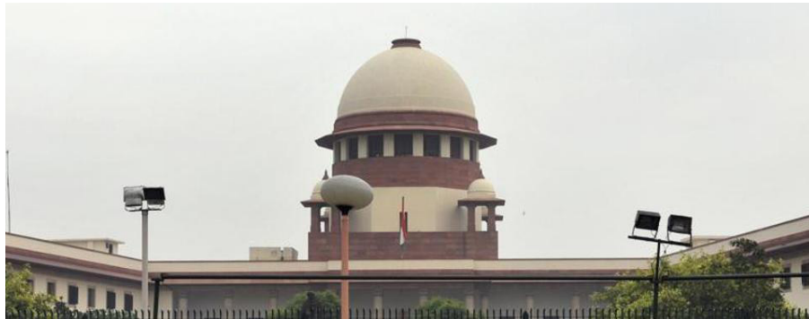
judges as on September 1.

While the approved strength is 1,079, these are working with 666 judges.