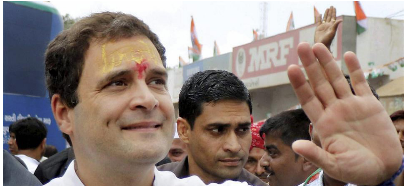
BJP," he said.