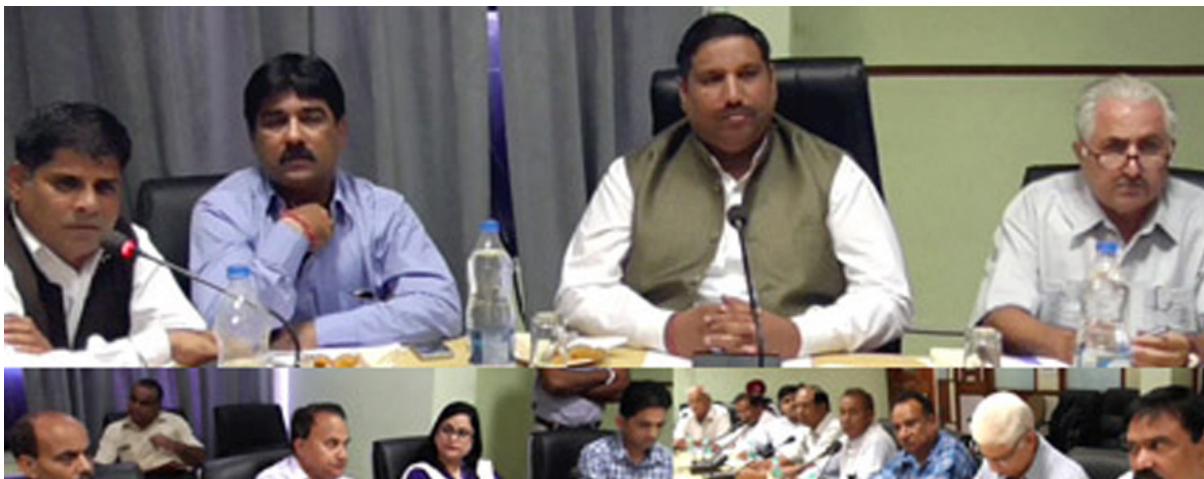
ments to work with utmost dedication for betterment and uplift of Scheduled

Vice Chairperson exhorted upon the officers of concerned depart-