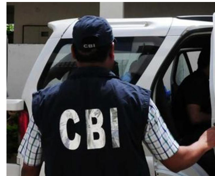
The probe has found that there was nothing suspicious about 23 deaths in which 15 preliminary enquiries were registered by the CBI. All the 15 enquiries have been closed by the agency.

NEW DELHI: The controversy over Vyapam scam-linked deaths erupted as Madhya Pradesh police included the names of dead people as accused in its FIRs registered in the cases related to the admission and recruitment scam, the CBI has found. The Central Bureau of Investigation (CBI) was entrusted with looking into the alleged conspiracy to eliminate suspects booked in the admissions and recruitment scam in MP. The probe agency was asked to investigate deaths of 24 individuals. Among the 24 deaths, 16 took place much before the deceased were booked in the scam by the state police, the probe has found, ruling out any conspiracy. The remaining deaths were due to natural causes, the agency said.