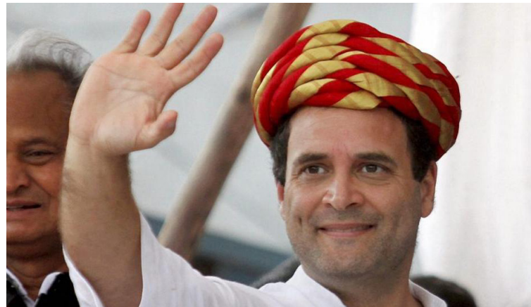
nearly Rs 12,500 crore" with his tweet. The Congress has accused the BJP and the government of "putting pressure" on the Election Commission to

NEW DELHI: Rhetoric will rain down on Gujarat, Congress vice president Rahul Gandhi said in a "weather report" ahead of Prime Minister Narendra Modi's visit to his home state on Monday. Gandhi's dig comes in the wake of speculation that the prime minister may announce a host of sops for poll-bound Gujarat. "Weather report: Ahead of elections, Gujarat will today have rain of rhetoric," he said on Twitter, using the phrase "jumlon ki baarish" in his Hindi tweet. The Congress vice president also tagged a Hindustan Times report headlined "As Gujarat waits for poll date, state gets projects worth