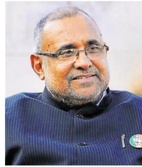
There were also speculations that the PDP and BJP may go for a reshuffle of the cabinet min-