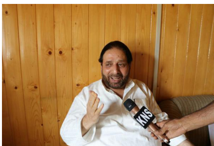
Government has totally failed to fulfil its promise to regularize all genuine need based, daily rated and adhoc workers working