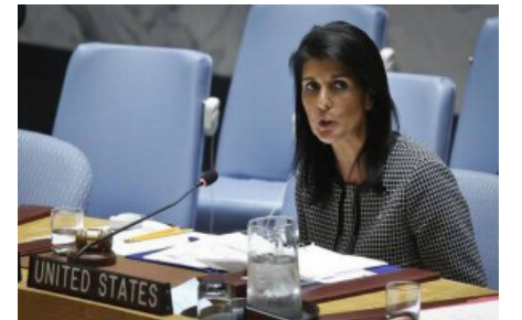
military to pursue these goals," she said. Critically we will look to our economic and security partnerships with India, she added.

"America's overriding interest in Afghanistan and throughout South Asia are to eliminate terrorist safe havens that threaten us. And to keep nuclear weapons out of the hands of terrorists, we will use all the elements of our national power economic diplomatic and