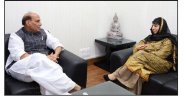
Singh assured Mehbooba of all central assistance to her government in maintaining peace in the state, a home ministry official said.

NEW DELHI: Jammu and Kashmir Chief Minister Mehbooba Mufti today met Union Home Minister Rajnath Singh and discussed various issues, including the recent spurt in violent incidents in the Kashmir Valley, an official said. During the 30-minute meeting, the chief minister briefed the home minister about the prevailing situation in Jammu and Kashmir and the steps taken to maintain peace in the state.