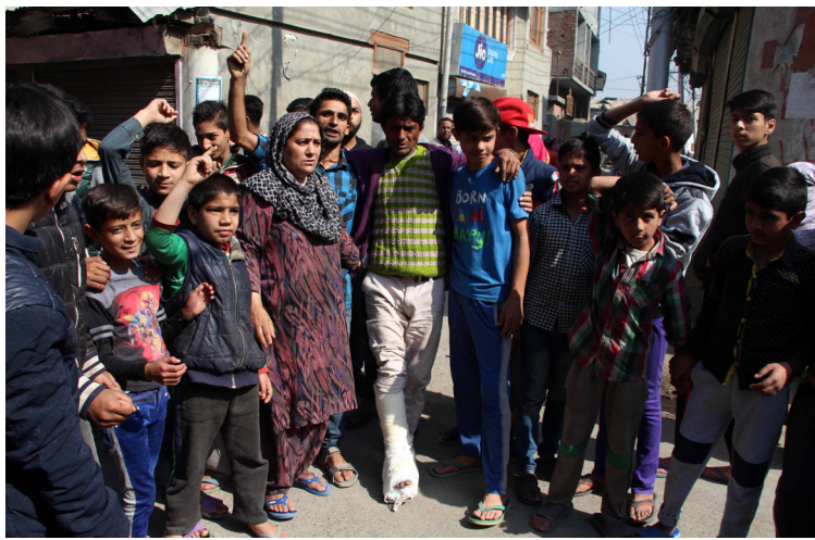
Protest erupted in Chattabal area of Srinagar city against an overnight braid chopping incident there. Large number of women hit to roads and

Srinagar, Oct 18: With authorities still clueless and 'desperate' to unfold braid chopping mystery, Kashmir continues to remain on edge while on Wednesday dozens of persons suffered injuries during clashes that sparked after fresh braid cutting incidents in various localities across Valley. Clashes erupted in Mehjoor Nagar area of Kashmir capital Srinagar after the braid of a woman was chopped off by unidentified miscreants. The incident created panic in the area while large number of youth hit to roads and clashed with government forces. The shopkeepers lowered their shutter as Forces fired a warning shot in air after agitated youth resorted to massive stone-pelting. Police lobbed tear-smoke shells, however, protesting youth continued to hurl rocks on Forces for hours together.