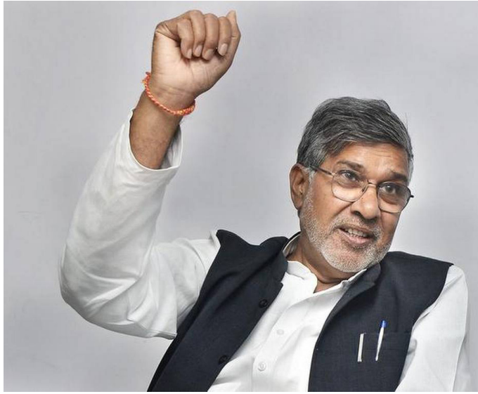
during the Bharat Yatra?

There is a major conflict between children's aspirations