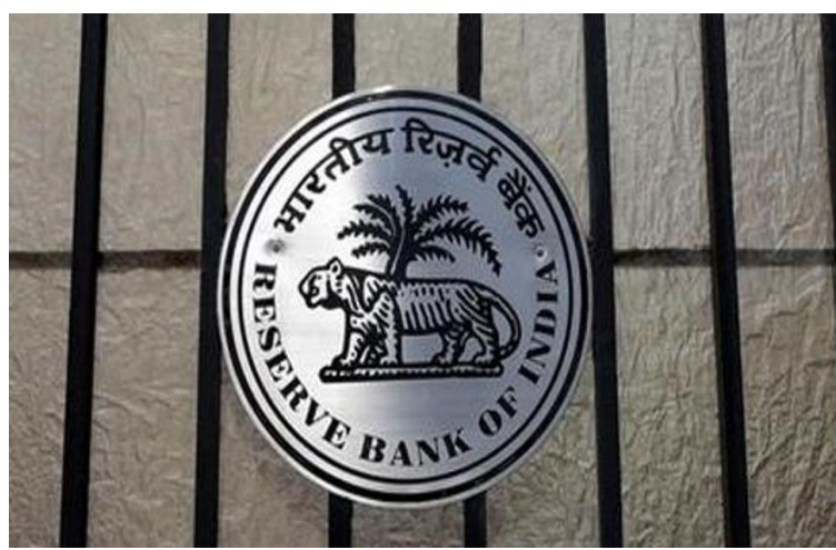
in overall GDP growth prints are transient or sustained."

"There is a need for more data to assess whether the recent headwinds