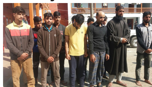
under sections of 307, 148, 149 RPC was registered in Police Station Sheeri. During investigation, it