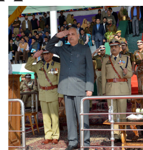
Animal & Sheep Husbandry, Cooperative and Fisheries, Mir Zahoor, Minister of State for Hajj & Auqaf (Independent charge), Syed Farooq An-

The function was attended by Minister of State for Forest, Ecology, Environment,