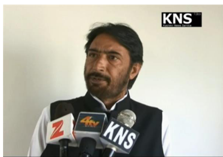
public when the people take law and order into their hands.

"The people shouldn't take law and order into their hands. Any suspicious person should be handed over to Police so that they can investigate his involvement properly," he said, adding that it gives a bad impression to the