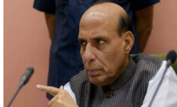
December, 2016. The minister dodged questions