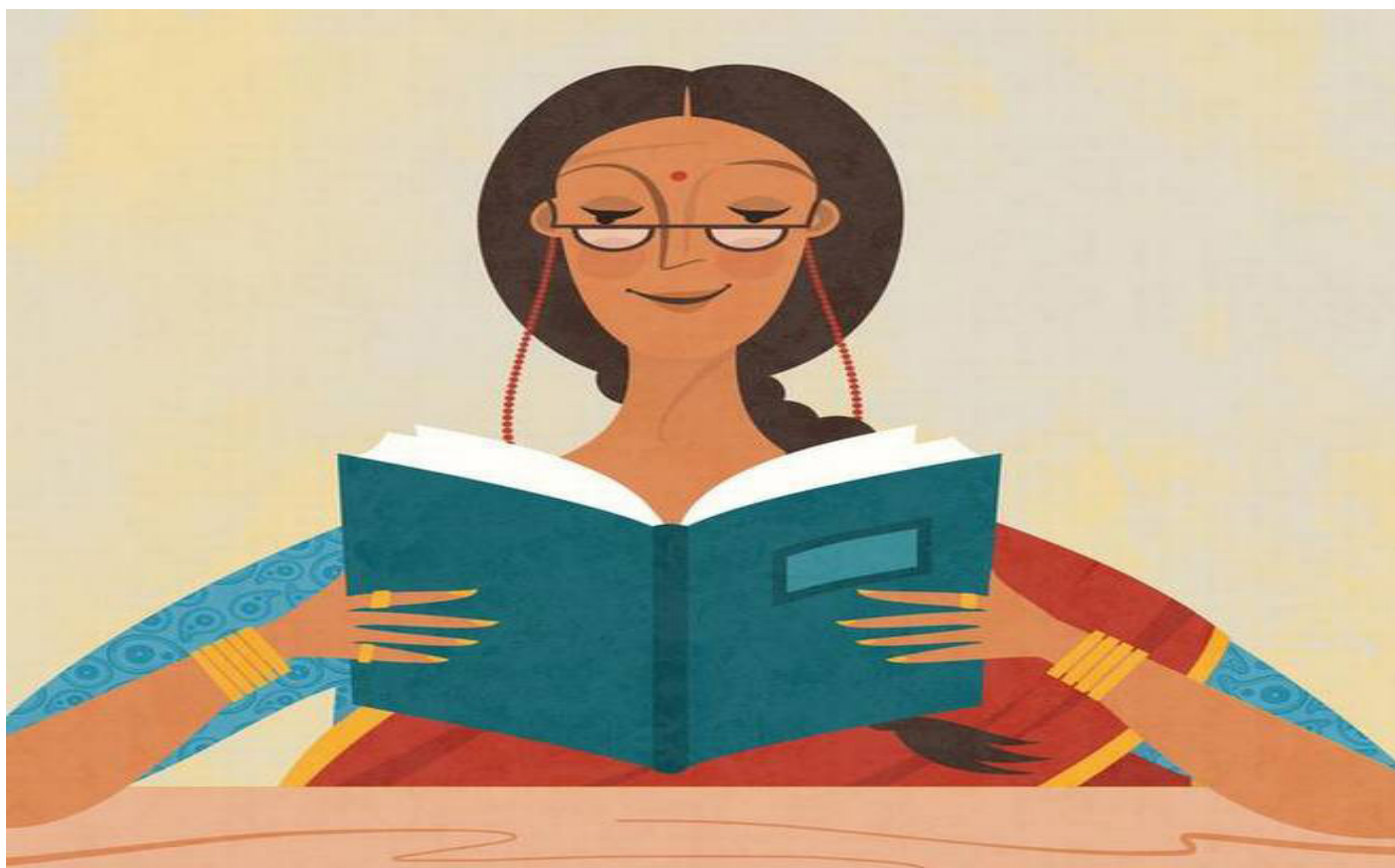
A girl who wears a saree or suit fights for the rights of women who are victims of domestic violence. A lady who fights for gay rights might be a feminist too. A man who strongly believes that all girls should be allowed to go

Now, people crib about the fact that they have to bear the burden of wearing a bra, that they have to shave their legs, that they are shamed for wearing short dresses. These are all issues, I agree, but they don't qualify to be feminist in nature.