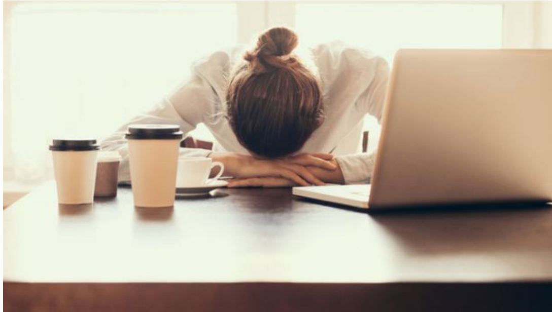
sleep patterns of 432 adults with chronic kidney disease. Participants wore a wrist monitor for five to seven days to measure sleep duration and quality, and their health was followed for a