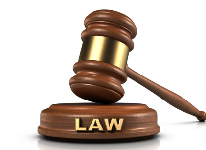
"In July this year, the Supreme Court had directed an independent investigation into over 80 cases of alleged extra-judicial