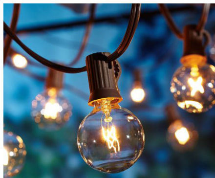
that power demand has increased and