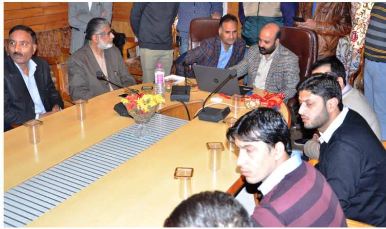
Further, the website gives the visitors better idea about DHSK and its activities besides efforts in delivering healthcare facilities across the Kashmir Division. The website will allow people to access detailed achievements done by the Department under various programmes and schemes.

After the launching ceremony, the Minister was apprised about the information and activities related to the Department that are being depicted on the website in a user-friendly manner. The website offers a simplified menu and an easy-to-navigate layout, so that the public can quickly and easily find information related to the services they need or seek.