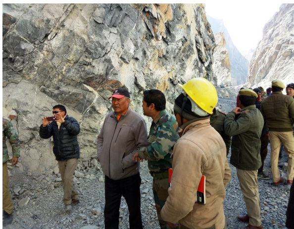
completion of this prestigious project will usher in a new era of unprecedented progress and development in the area, he said. The Minister said that to speed up the work on the Nimo-Padum-Darcha Road additional funds to the tune of Rs 1250 crores have been sanctioned.

The Minister said that to provide better road connectivity to Zanskar valley project worth Rs 4200 crore has been sanctioned by the Government under PMDP and work on the project is in full swing. The