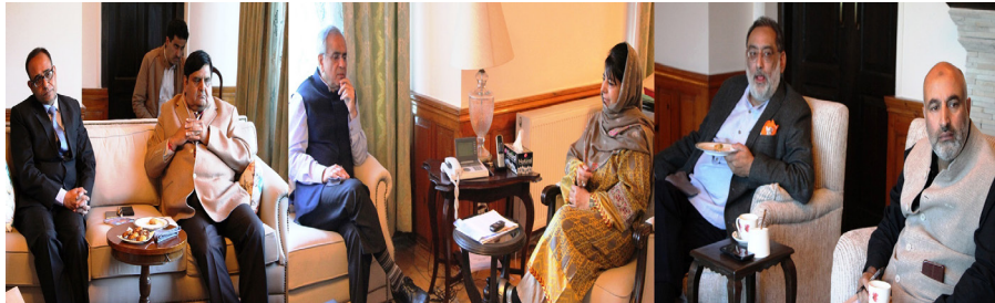
cific in view of the peculiar nature of Jammu & Kashmir.

The Chief Minister brought to the notice of Dr. Rajiv Kumar the need for making the allocation agenda State spe-