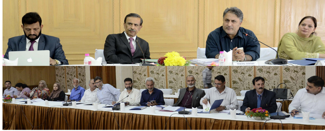
sult academicians before the incorporation of integrated courses or about the start of new courses