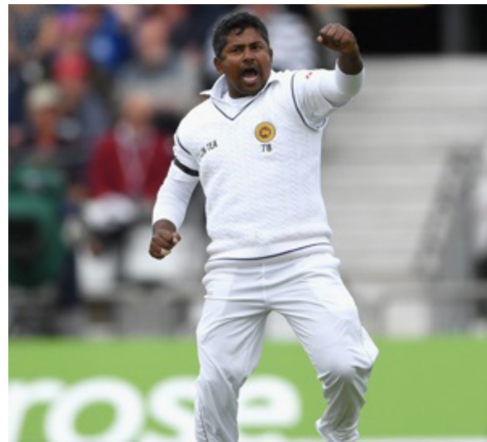
come with the squad due to a calf injury. Sarfraz Ahmed hopes Pakistan team moves on from the defeat in his first Test as captain.

time since they retired in May this year. Sri Lankan skipper Dinesh Chandimal described Herath as "a team man and an asset." "I have no idea how long he is going to play, but I am sure he will do what he can for the team," said Chandimal of Herath who completed 400 wickets in his 84th Tests in Abu Dhabi. "He is a team man and an asset." The left-arm spinner also reached 100 wickets against Pakistan during the first Test. "We need to beat our best again and can't underestimate Pakistan because we know they are a good team," said Chandimal whose team will rise one spot to replace Pakistan on sixth, even with a 1-0 result. Chandimal anchored the batting with a polished 155 not out in Sri Lanka's first innings total of 419, ably filling in for the more experienced Angelo Mathews who didn't