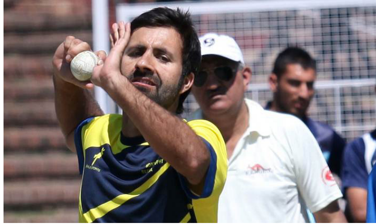
elling by bus to Jaipur, which is around a five to six hour drive, so there won't be time for practice," said a member of the J&K team.

"We are taking an 11.00am flight from Srinagar to New Delhi on Thursday. From Delhi, we are trav-