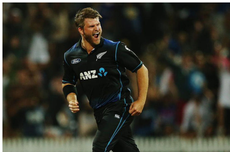
ple may not know now but who in the years to come will become household names. In 2010, it was my first snip-

"It is extremely exciting to be involved again in the U19 World Cup. I played two of them - it is the first stepping stone to playing international cricket. You go from playing domestic cricket to playing international cricket - it's a big step but it's a step that is necessary," Anderson was quoted as saying in an ICC release. "To have it in our backyard is great. We are going to see players who peo-