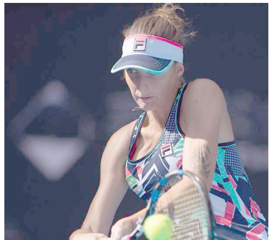
is Caroline Garcia, who defeated French compatriot Alize Cornet 6-2, 6-1. Garcia is in red-hot form after winning the Wuhan Open title on Saturday.

BEIJING: Karolina Pliskova, former number one and fourth seed, became the latest high-profile casualty at the China Open on Thursday, going out in the third round to unseeded Sorana Cirstea. Cirstea follows fellow Romanian Simona Halep into the quarter-finals, after second seed Halep sent Maria Sharapova packing on Wednesday. Cirstea, ranked 44 in the world, stunned the Czech Pliskova 6-1, 7-5 on Beijing's outdoor hard courts to surge into the last eight. She will play home hope Peng Shuai or Latvia's Jelena Ostapenko, the Roland Garros champion. World number one Garbine Muguruza and reigning champion Agnieszka Radwanska are both out to leave world number two Halep the favourite in the Chinese capital. Also into the quarters