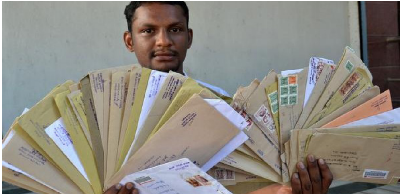
"Diluting a right", Frontline, May 12, 2017, for a detailed explanation).

Consider draft Rule no. 12, the most controversial one that the international non-profit organisation Commonwealth Human Rights Initiative referred to as a "death sentence" for RTI users. This draft rule is controversial for the following reasons. It specifies the conditions under which an RTI user can withdraw his appeal for information from the CIC. Section 1 of the rule empowers the CIC to permit withdrawal of appeals for information by RTI users and Section 2 states that the proceedings pending before it "shall abate" if the person making the appeal dies before a decision is arrived at. This has alarmed RTI users and pro-transparency campaigners who have pointed out that silencing and attacking those who ask uncomfortable questions could now become easier (See