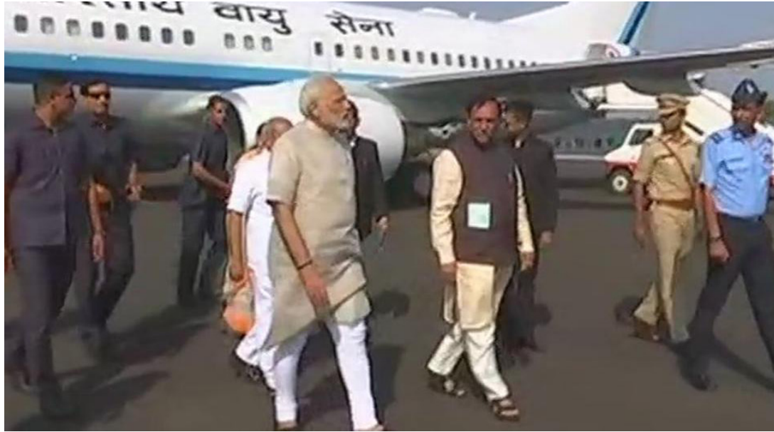
he will lay the foundation stones for a greenfield airport at Rajkot. The PM will also dedicate a fully automatic milk processing and packaging plant and a drinking water distribution pipeline for Joravarnagar and Ratanpur area of Surendranagar, a PMO statement said. At Gandhinagar, Modi will

From Dwarka, he will go to Chotila in Surendranagar district where