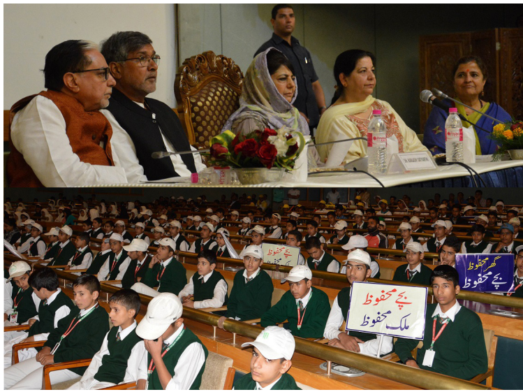
Mehbooba Mufti appealed parents

The function was organised by J&K State Commission for Women in collaboration with Kailash Sathyarthy Foundation.