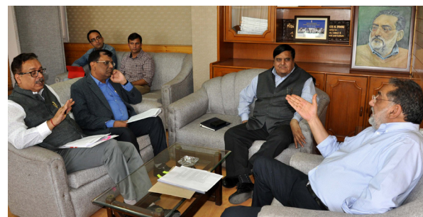
The Finance Minister was speaking during a meeting of the Pay Anomaly Committee