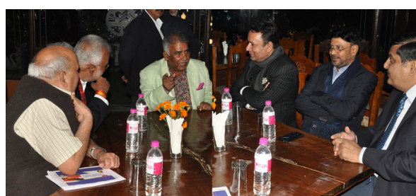
action with a delegation of Press Council of India (PCI) led by its Chairman Justice C K Prasad presently in Kashmir for the annual meeting of the Council.

The Minister expressed these views during his inter-