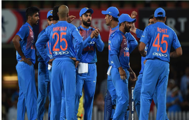
figures by an Australian bowler in T20Is in India.

Kohli, Rohit Sharma, Shikhar Dhawan and Manish Pandey became his victims as the 27-year-old, playing his debut series, returned with best