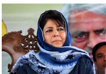
However, the alliance partner of

The government had said that the investigation is going on to trace the culprits behind braid chopping incidents.