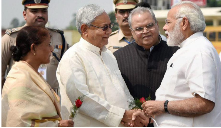
officials of civil services are students of Patna University.

Modi said when the country celebrates the 75th Independence Day in 2022, he wants to see Bihar standing among the list of prosperous states. Modi also said that many top level