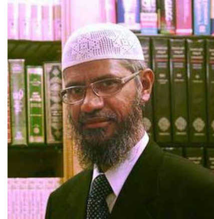
NIA to file a charge sheet against Naik. Chargesheet filed

The delay on India's part in completing the legal process for submitting the extradition request is being attributed to the wait for the