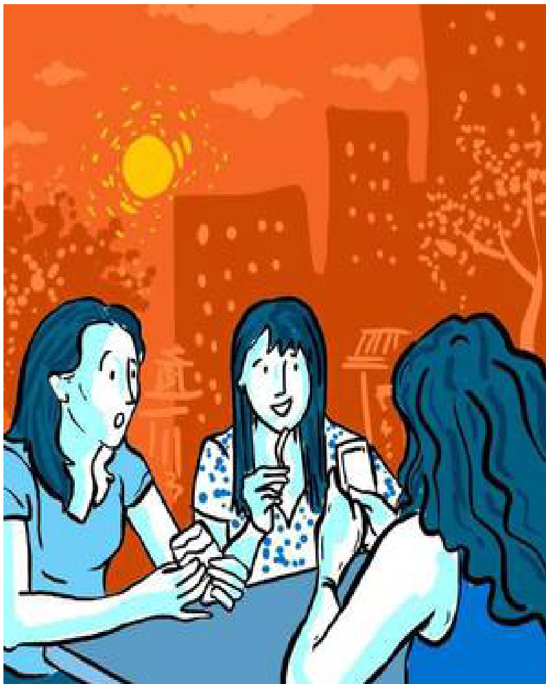
that gate was what led us to the Buza Bar, whose stocks we went through like

As if that was not enough, the sun was at the perfect angle in a cloudless sky, catching every rising wave and making a momentary jewel out of each of them. Three of us had 'awestruck' written on our faces in different ways — mouth hanging open to eyes bugged out to "Oh (read profanity of your choice)!" And