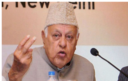
has sought "immediate investigation" and "arrest" of the Srinagar MP alleging that he has favoured Pakistan and insulted India. It has alleged that Abdullah has been making "such controversial remarks and statements