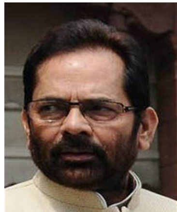
facilities. "The government of India would provide all possible support to the state governments including the Jammu and Kashmir government for facilitating the guests of Allah in per-

The Chief Minister, Mehbooba Mufti has pleaded for extending more facilities to the Hajj pilgrims of the State during the coming annual pilgrimage. In her letter to union Minister for Minority Affairs, Mukhtar Abbas Naqvi, the Chief Minister has detailed the facilities being provided to Hajj pilgrims at Srinagar embarking point and beyond. She has sought further strengthening of the same in future. The Chief Minister has said the facility of embarkation at Srinagar saves a lot of time and cost of the pilgrims from the State and sought continuation of the same. Naqvi further told KNS that his ministry will make sure the better process of hiring of accommodation, transport, catering and other allied