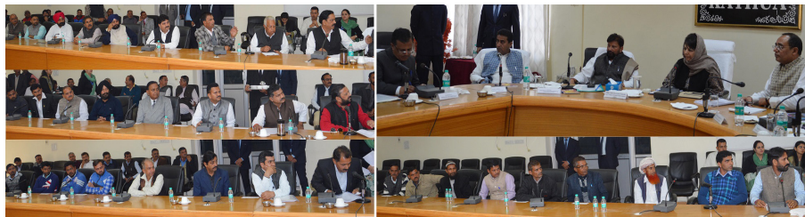
mental needs and sought their redressal. Minister for Forests, Environment & Ecology, Choudhary Lal Singh and legislators of the District were present on the occasion. The deputations in

KATHUA, NOVEMBER 20: A day after conducting her Public Outreach programme at Samba, Chief Minister, Mehbooba Mufti visited Kathua and convened a grievances redressal camp here today. During the camp the Chief Minister listened to scores of deputations and hundreds of people who apprised her of their develop-