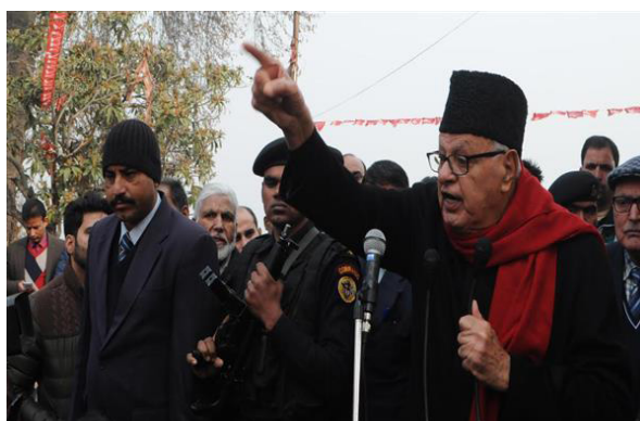
never was and never would be an alternative to a broad-

Srinagar, Nov 21: National Conference President and Member of Parliament, Dr. Farooq Abdullah on Tuesday said successive Central Governments had failed to engage with the sentiment in Kashmir in a sustainable and reconciliatory manner. Talking to various public delegations that called on the Party President at the National Conference Head Office, 'Nawa-e-Subha' in Srinagar on Tuesday, Dr. Farooq Abdullah said there