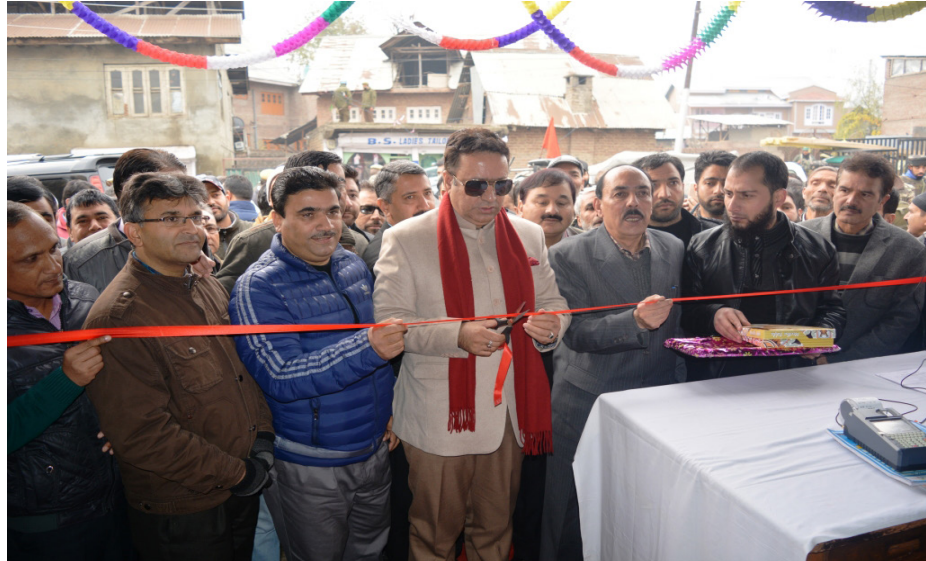
like celebration of the birth of girl child, display of birth statistics through Gud-