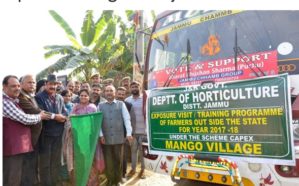
ganized by the department at Government Fruit Plant Nurs-

The Minister said this while addressing a group of farmers from Akhnoor and Chamb area at an event or-