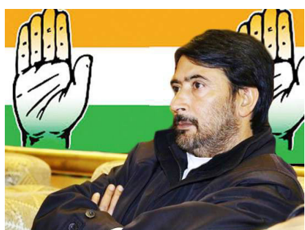
wrong decision on the part of Central ▶ See Mir....Pg 02

In a statement issued to KNS, Mir also expressed serious concern over minimizing subsidy on Haj Pilgrimage terming it as a