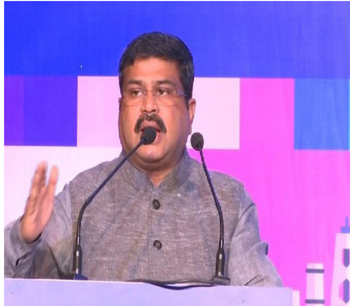
capita consumption of energy is lowest in the world. It is going to increase rapidly in the coming years. India now con-

The Union Minister also said that the per capita energy consumption in India is lowest in the world, which needs to be increased. "Today, India's per