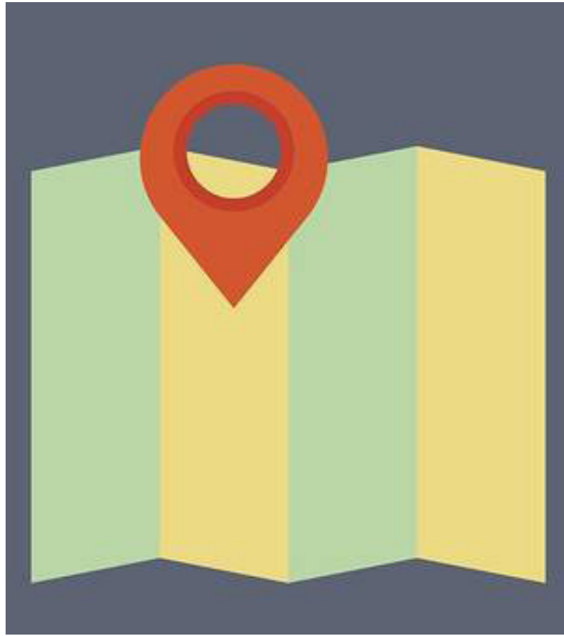
GIs as laid down under GI Rules, 2002, and clarified by the GI Manual of the Office of the Controller General of Patents, Designs and Trademarks, and Registrar of Geographical Indications to establish proof of origin. The point

Against this backdrop, proof of origin is a mandatory criterion for registering GIs in India. This provision is borrowed from the EU's regulations on GI protection. What is cause for concern is not proof of origin as a criteria to register GI, but the focus on historic proof in the form of documentary evidence (such as gazetteers, published documents, news articles, advertisement materials) to bring out the historic development of