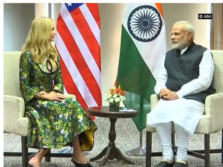
First, Prosperity for All," the three-day summit will witness majority of women participants, with over ten countries being led by all-female delegation.

Ivanka arrived at the Rajiv Gandhi International Airport in Hyderabad early Tuesday morning, ahead of the Global Entrepreneurship Summit. On a related note, the summit is being hosted for the first time in South East Asia by the Governments of India and the United States. With the theme of "Women