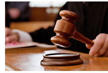
CBI sought more time to complete its investigation. In a status report submitted before the court, the investigative agency stated that the probe was underway and that it re-