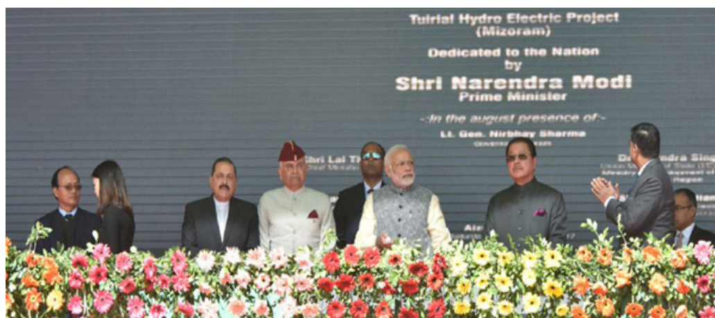
in Meghalaya's capital Shillong and inaugurated the much needed 261-km long two-laning of Shillong Nongstoin section of National highway 106 and Nongstoin Rongdeng section National Highway 127 B. On the occasion he told that the road would serve as an east-west corridor for Meghalaya. "It will boost economic activ-

long awaited project, he said, "With the commissioning of the project, Mizoram becomes the third power surplus state in the northeast after Sikkim and Tripura." Blaming the previous government, he added, "The project was first declared at Mizoram by Prime Minister Atal Bihari Vajpayee way back in the year 1998, but got delayed." Besides generating electricity, the reservoir water is also going to open new avenues for navigation which will provide connectivity to remote villages. People from all walks of life from the landlocked state of Mizoram gathered in number to witness the developmental strategies put forth by PM Modi for the region's economic growth. The prime minister also interacted with Self Help Groups of Mizoram who put up a special exhibition of various products ranging from organic to handloom and handicrafts. From Aizawl, PM Modi arrived