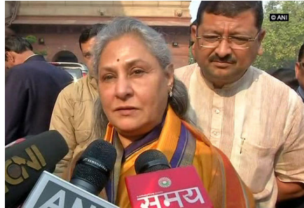
Earlier in the house, Sachin did not get a chance to speak as the uproar over Prime Minister Narendra Modi's recent remarks on Dr. Manmohan Singh forced an adjournment of the house.

NEW DELHI: Rajya Sabha MP Jaya Bachchan on Thursday expressed disappointment over the uproar by the politicians in the house, when MP Sachin Tendulkar was about to deliver his debut speech, and said it is a matter of shame that the latter was not allowed to speak. "Sachin Tendulkar has earned name for India at the world stage. It is a matter of shame that he was not allowed to speak, even when everyone knew it was on today's agenda. Are only politicians allowed to speak?" she asked. "If a person is treated like this, why would he come to the house?" she added, in a reply to the allegations that the master blaster rarely attends the sessions of the Parliament.