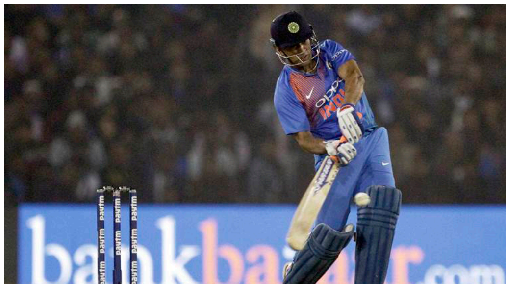
Dinda to take four wickets vs Sri Lanka in a T20I. Chahal has received his second

Yuzvendra Chahal (4/23) has registered his second best bowling figures in T20Is next only to the 6 for 25 vs England at Bengaluru on February 1, 2017. Chahal became the third Indian bowler after Ravichandran Ashwin and Ashok