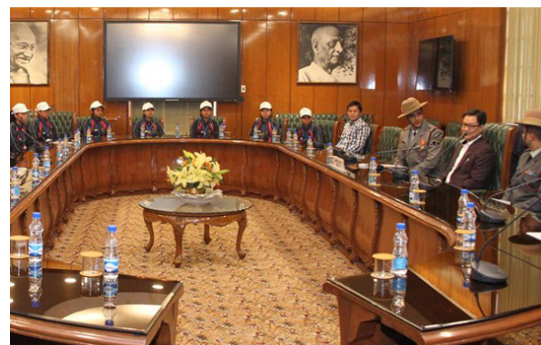
students are visiting landmarks like the Taj Mahal, Fatehpur Sikri, forts in Agra and Delhi, Rajghat, India Gate, National Museum, Pragati Maidan and the Delhi Metro.

NEW DELHI: Eighteen students from Manipur's Bishnupur district called on Minister of State for Home Kiren Rijiju here today. The students are taking part in a national integration tour organised by the 42nd Assam Rifles from December 14 to 26. Rijiju complimented the Assam Rifles for organising the tour under "Operation Sadbhavna". Rijiju called upon the children to share their experiences with family and friends back home after the tour ends. The tour is aimed at promoting the concept of unity in diversity. The