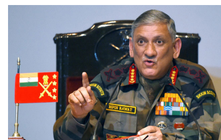
ing militants. Only then can we say that peace

Rawat said Pakistan should stop support-