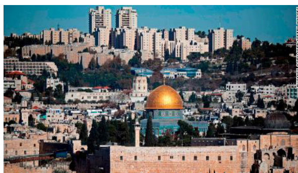
salem as Israel's capital.

Srinagar, Dec 22: The people in Kashmir from different shades of life Friday welcomed India's clear-cut rejection by voting against the United States decision on Jerusalem's status at United Nations General Assembly (UNGA). The UNGA on Thursday adopted by a decisive vote of 128 to 9, with 35 abstentions, a motion rejecting the US decision to recognize Jeru-