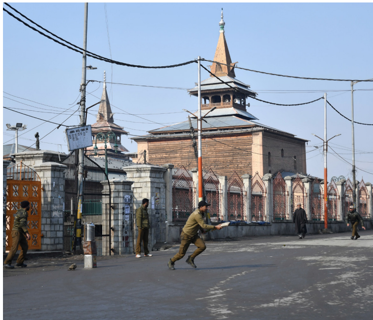
on the wires, halting the vehicular as well as the pedestrian movement.

A large contingent of Police and forces were deployed in Srinagar areas who had erected concertina wires