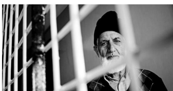
most undemocratically kept her incarcerated, only for rais-

In a statement issued to KNS, Geelani said, "Asiya is unwell and is suffering from many ailments but puppet rulers claiming to represent a democratic coalition have