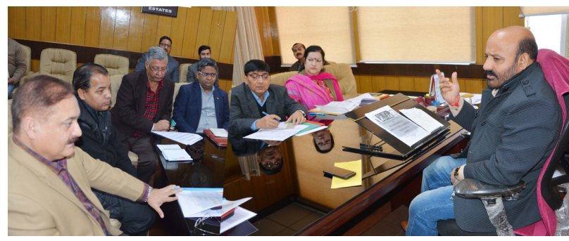
ernment. This scheme would provide free of cost healthcare benefits in any public or private hospital across the country thus providing direct cash to the beneficiaries. Under the scheme, the Smart Card based on biometric technology system will be issued to the family to avoid any chance of duplication of service.

titled to cashless hospitalization upto Rs. 30,000 per family per financial year. For senior citizens of these families, an additional coverage of Rs. 30,000 per senior citizen in the eligible family under Senior Citizens Health Insurance Scheme will also be available. The Minister directed the Principal Secretary, Health & Medical Education to take immediate measures for speedy implementation of this important scheme to give succor to the poor families. He also called for arranging 10 per cent share of the state government for the premium amount as rest of 90 per cent share will be borne by the central gov-