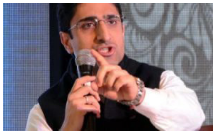
"A young entrepreneur takes on unimaginable risks in a strife-torn State like J&K to add economic value and jobs in the system."