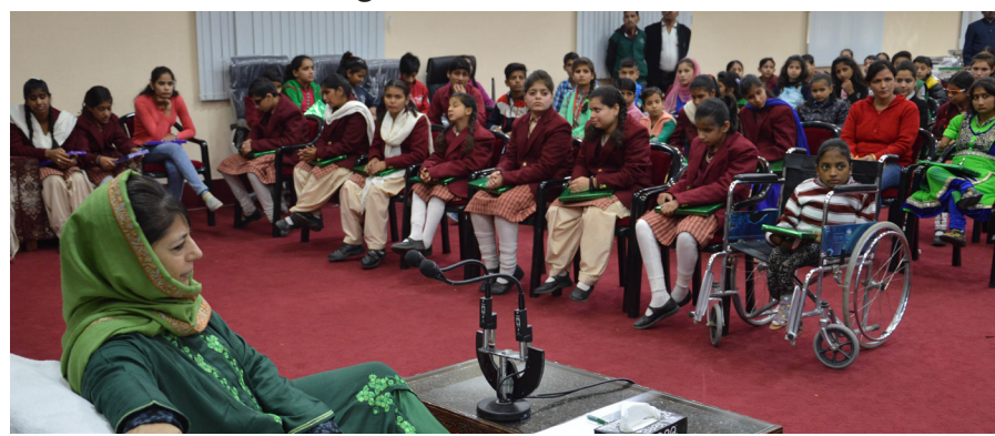
Jammu, Dec 08: A group of specially abled students called on the Chief Minister, Mehbooba Mufti here today.

Mehbooba announces grant of Rs. 10 lacs for their welfare