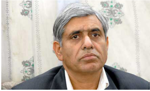
Kashmir have been worst sufferers of Indo-Pak confrontation