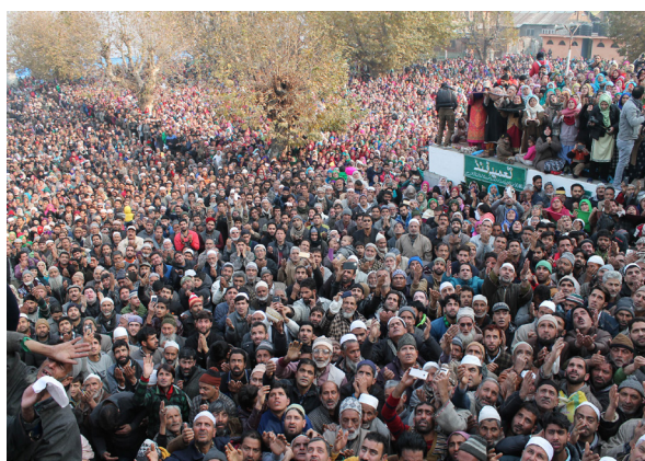
1st Rabi-ul-Aawal of the Islamic calendar in Kashmir

While the birth anniversary of Prophet Muhammad (SAW) was observed last Friday, devotees in the Valley also observe Friday following Eid-e-Milad with fervor. The Milad celebrations started on