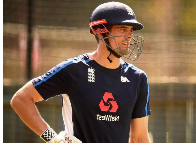
LONDON: Former England captain Alastair Cook insisted retirement is not on his mind as he prepares for his 150th Test against Australia in the Ashes.

Already England's most capped Test player, veteran batsman Cook will reach another milestone when struggling Ashes holders England face Australia in Perth on Thursday.