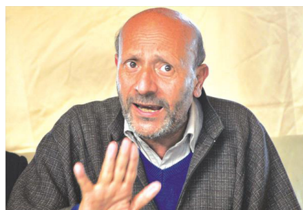
huge sacrifices and nobody will be allowed to sell the blood of martyrs. He reminded Governor of his constitutional authority, erosions in the constitution of J&K made by New Delhi from time to time, NIA raids on