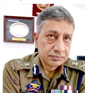
"It is good that the youth are joining their families again as it is Pakistan who is creating the violence here," he said,

He said that seven youth had shunned the path of violence earlier and now three more youth joined their families today.