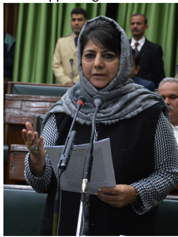
for the upliftment of the masses.

The Chief Minister described late M L Fotedar as a very intelligent politician who rose through to a very high position of Union Minister by dint of hard work. She said the late leader worked closely with former Chief Minister, Mufti Mohammad Sayeed and would long be remembered by the people of the State for his work