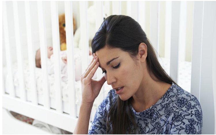
Impact on IQ

For the study, researchers surveyed about 900 healthy children and their mothers living in Santiago, Chile, at five-year intervals from the child's infancy through age 16. They observed how affectionate and responsive mothers were to their children at each age period, as well as how much mothers provided age-appropriate learning materials.