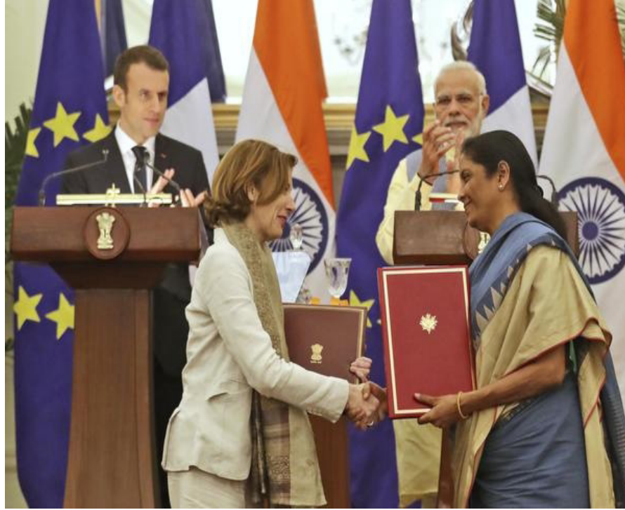
Military front against China

So far, India has signed LEMOA-like agreements only with the U.S. and France, two leading members of the powerful North Atlantic Treaty Organisation (NATO) military alliance that have shared geostrategic interests. France and Germany, the two leading European powers, are engaged in building a strong military alliance of their own. At the recent Munich Security Conference, senior German and French officials conveyed their strong support to the Asian Quad, a military grouping comprising the U.S., Japan, India and Australia, which was reactivated last year.