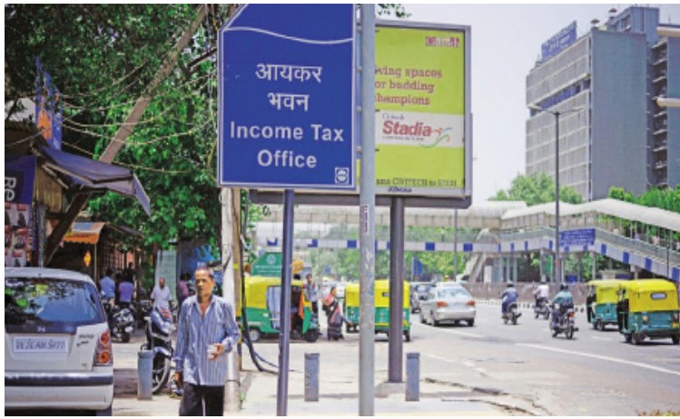
Rs 1 crore.

The final amount, which the informant will get two years after the confiscation of the property provided there is no litigation, will be 5% of the total cost with the maximum cap of