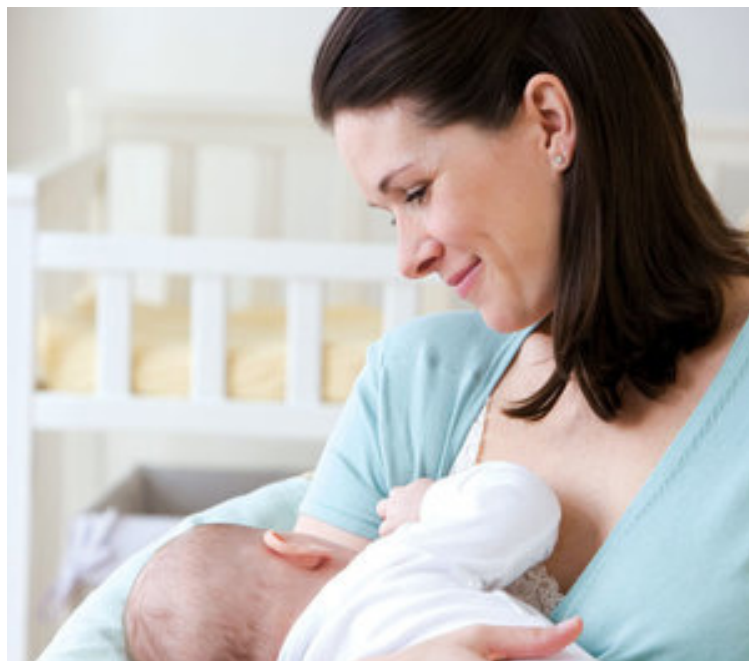
In the study, published in the journal Developmental Psychology, women breastfed for an average of 17 weeks. Fewer than one per cent breastfed for 24 months and 29% did not breastfeed at all. Researchers interviewed and

Researchers, including those from Boise State University in the US, analysed data from interviews with 1,272 families. They were recruited when their infants were a month old, mothers completed a home interview and became part of the initial study sample. The sample included a substantial proportion of less-educated parents — 30% had no college education, and ethnic minority families — 13% were African-American.