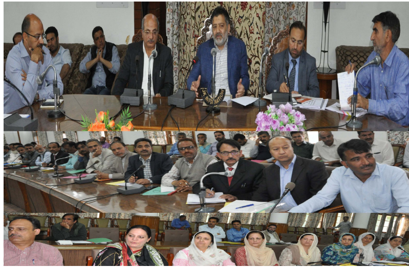
the onus of building a strong and developed nation lies.

"A discernible transformation is being witnessed in all parameters of education with a notable development in infrastructure and related facilities in educational institutions of the state," he said. He emphasized the need for involving all stakeholders, including parents, teachers and local legislators, in further streamlining of the vital sector on which