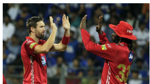
alone hand with a 60-ball 94. "It's bitterly disappointing that we did not win against Mumbai tonight. We had the

The Western Australia player also blasted his batsmen for not being able to provide adequate support to KL Rahul, who again played