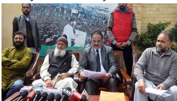
ing DFP chairman for 18 minutes only after waiting for