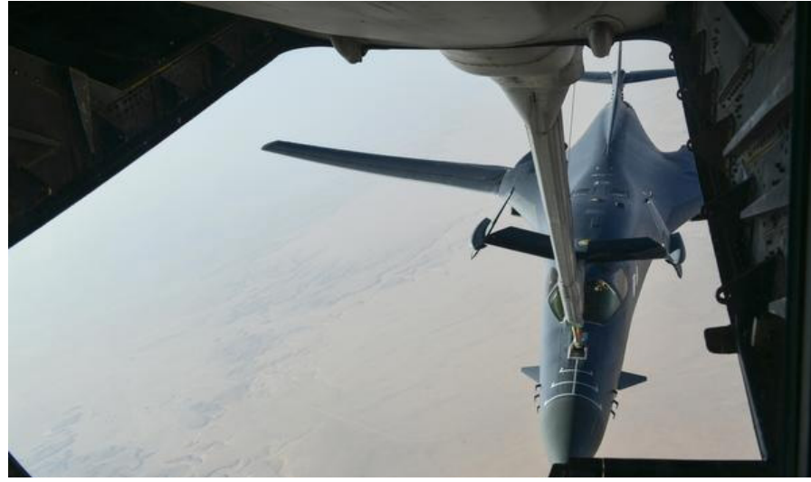
Syria used poison gas?

The VIPS also noted that the Russian military and the Syrian Army, both of which entered Douma immediately after pictures of the alleged victims were circulated, found no traces of poison gas or chemicals. After the fall of Douma, the U.S. and its allies like Saudi Arabia have lost the ability to militarily target Damascus from the ground. Douma is located close to the Syrian capital. "A major question for us, as former intelligence officers with some knowledge of the operational use of false information and false flag actions, is what motive would the Syrian government have for making a chemical weapons attack on its own civilian population, especially at a time when it has growing popular support and is having increased military support. Why would it risk Western ire?" the statement said. An American citizen expressed his concerns in a letter to The New York Times a few days before Trump carried out his threat. He asked the following pertinent questions: 1. Why is the death of a few dozen by poison gas in Syria worse than the slaughter of thousands by conventional armaments? 2. Why is it the obligation of the U.S. to punish Syria? 3. What gives the U.S. the legal right to attack another country when that country is not threatening us? 4. What independent authority has found out that