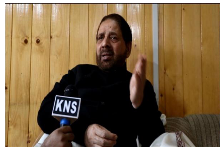
and to resolve all outstanding issues through talks, He hoped that both the countries would tread the path of peace and friendship.

Expressing satisfaction over reports about revival of Track 11 diplomacy between India and Pakistan to improve bilateral relations