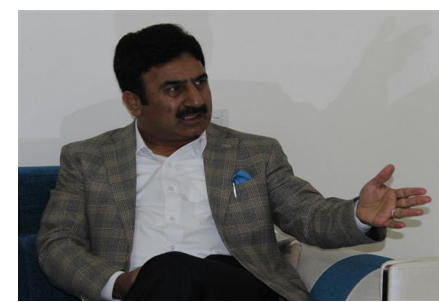
previous lives of the innocent people who are falling prey to the violence.